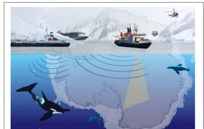
FIGURE 1 | Sketch of sources of underwater noise in the Antarctic. All vessels (fishing vessels, cruise ships, research vessels, etc.) produce underwater noise in a nearly omni-directional pattern (indicated by circular sound wavefronts). Ships use echosounders that scan the sea floor with a narrow swatch of sound (indicated in yellow). Research station infrastructure and support includes construction activities, vessels as well as aircraft—all of which may be detected under water.