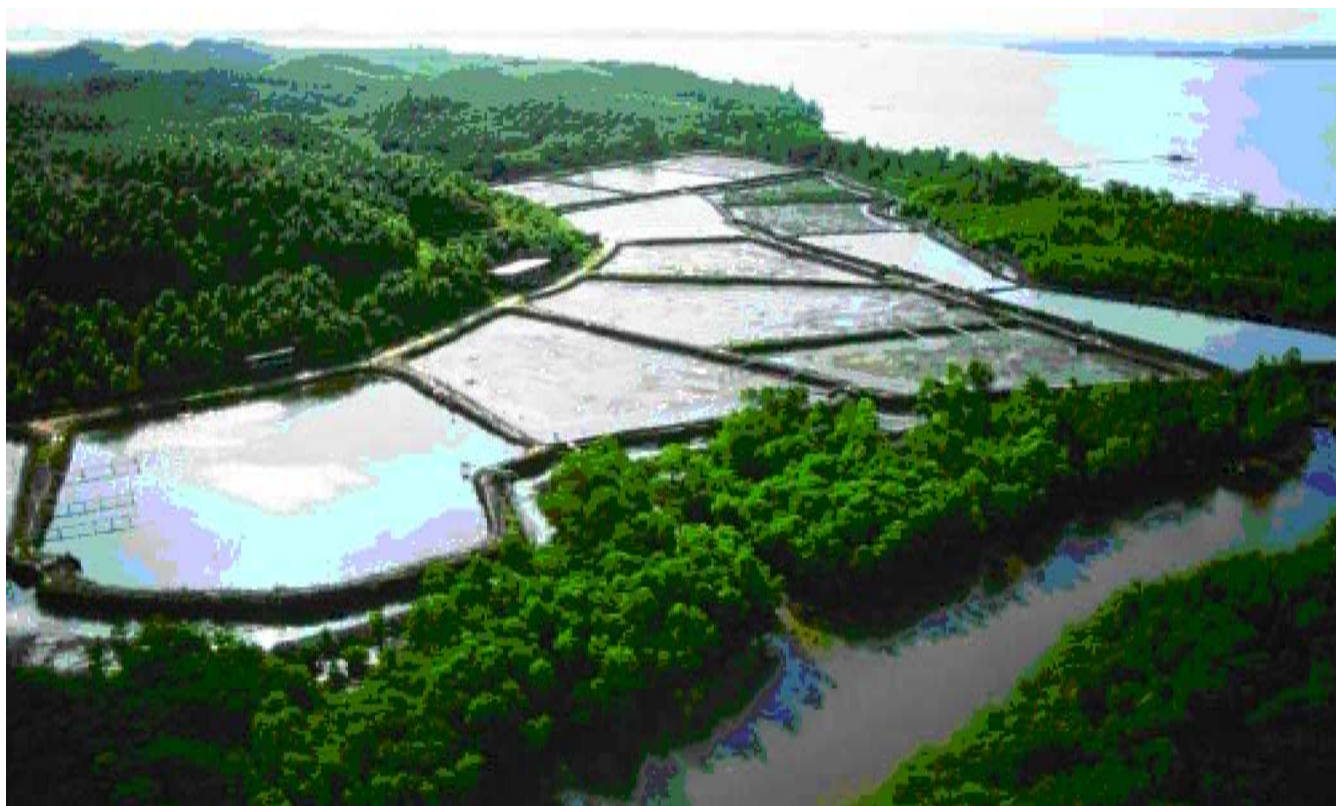
Figure 3. Oblique aerial view of a mangrove forest in Borneo, showing dikes and enclosed shrimp ponds carved out of the mangrove habitat.