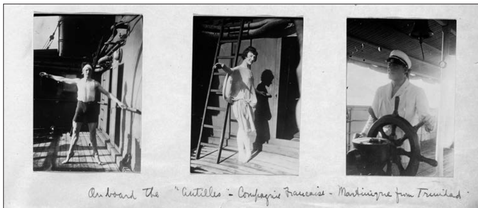
Figure 1. Dancers in Anna Pavlova's company practice at a makeshift barre onboard a ship.

Despite the existence of many projects of archival digitization and online presentation in the field of dance, 1 we are not aware of any projects involving historical cultural analytics and inquiry-driven visualization of historical data in dance studies besides our own. We thus build on the foundations of our ongoing projects while drawing into conversation the ways in which digital methods can facilitate large-scale comparative analyses of the mobilities evidenced in the phenomenon of dance touring.