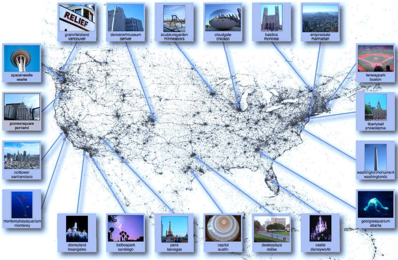
Figure 2: Representative images for the top landmark in each of the top 20 North American cities. All parts of the figure, including the representative images, textual labels, and even the map itself were produced automatically from our corpus of geo-tagged photos.

methodology is based on qualitative user assessments of just 10 locations in a single geographic area (San Francisco) and using only about 110,000 photos, again making it difficult to generalize their results. Their method also does not scale well to a global image collection, as we discussed in Section 3. There is a considerable earlier history of work in the Web and digital libraries community on organizing photo collections; however those papers in general make little or no use of image content (e.g., [1]) and again do not provide large-scale quantitative results.