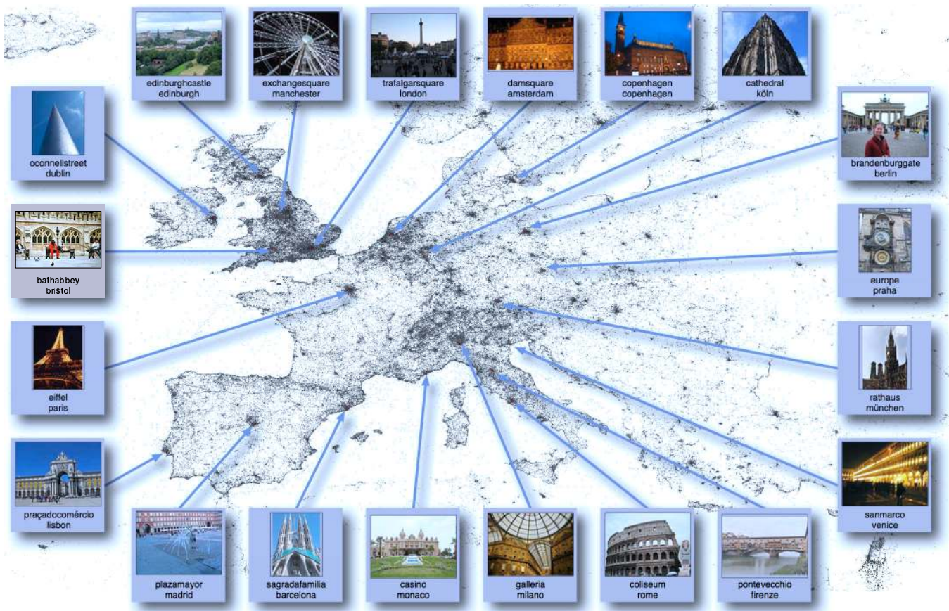
Figure 3: Representative images for the top landmark in each of the top 20 European cities. All parts of the figure, including the representative images, textual labels, and even the map itself were produced automatically from our corpus of geo-tagged photos.

Visual categorization with bags of keypoints. Statistical Learning in Computer Vision , ECCV, 2004.