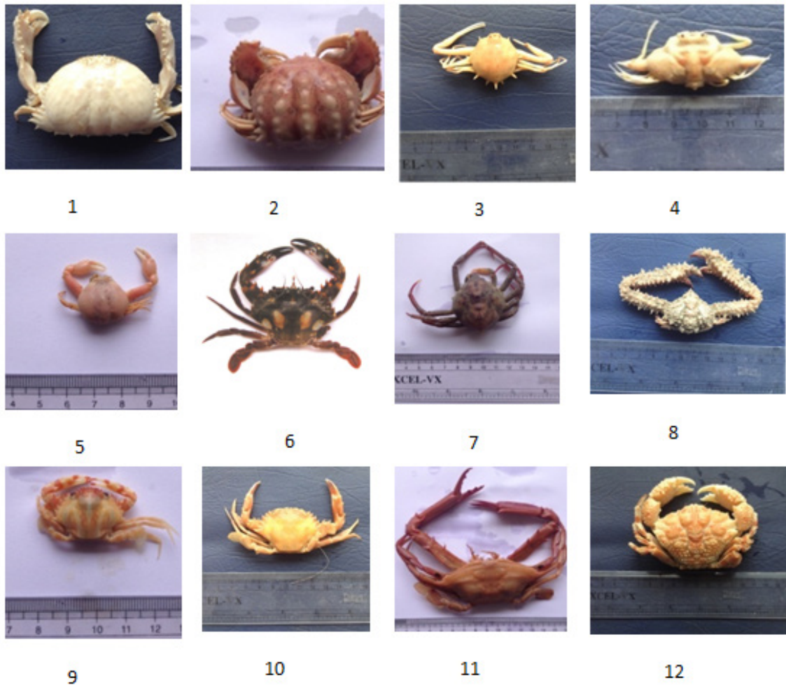
PLATE 1. Interesting crabs of Digha coast 1. Calappa lophos (Herbst); 2. Calappa pustulosa Alcock; 3. Arcania septemspinosa (Fab.); 4. Ixa cylindrus ( Fab.); 5. Leucosia sima Alcock; 6. Charybdis (Charybdis)lucifera (Fabricius); 7. Doclea muricata (Herbst); 8. Parthenope longimanus Linn.; 9. Cryptopodia angulata H.M.Edward; 10. Charybdis vadorum Alcock; 11. Podopthalmus vigil ( Fab.); 12. Demania splendid Laurie.