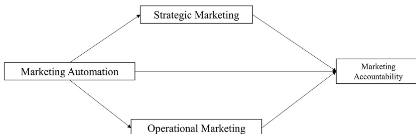
Figure 1. The identified components of marketing accountability