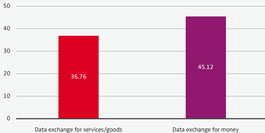
FIGURE 1 > The monetary value consumers associate with providing three hours of their personal GPS data in exchange for goods or for money (in £)

Results from one of our experiments, n = 140, similar results in follow-up experiments