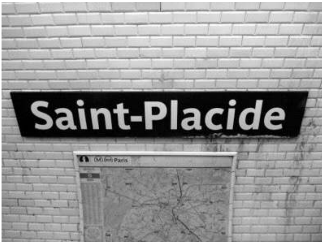
Figure 4. Mold on a signboard

We were also confronted with the fact that signboards could have a much more turbulent life than imagined initially. Far from being condemned to immobility, some of them do actually