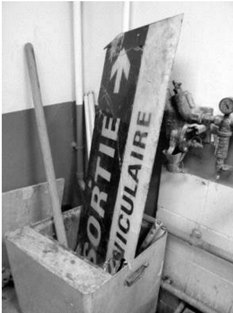
Figure 1. A signboard in a trash bin

In this article, we would like to explore this last option and to do so we will examine two aspects of the sign, as both a stabilization and ordering device and as a fragile object. In linking the image of the discarded board to the work needed to guarantee the Paris wayfinding system's existence through time, we aim to show the strong ties between these two aspects of the signboards as well as the role played by repair and maintenance (Henke 2000; Graham & Thrift 2007) in their articulation. Our goal is to pursue discussions on non-human agency and artifact performativity (Latour 1996; Knorr-Cetina 1997; Pels et al. 2002) and particularly on the role played by objects in the production of sociomaterial order (Winner 1986; Verbeek 2004).