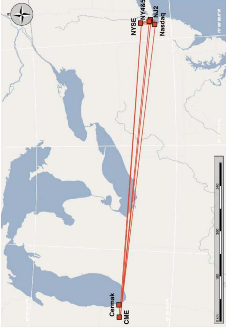
FIG. 4.—Geodesics from Chicago to the New Jersey share-trading data centers. CME is the main Chicago Mercantile Exchange data center in the city's western suburbs; Cermak, just outside the Chicago Loop, is a multiuser data center, hosting both share and futures trading. The CME's matching engines were in Cermak until 2010.