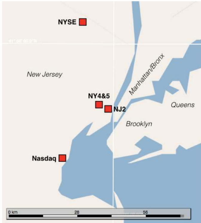
FIG. 1.—The five main U.S. share trading data centers. NY4 and NY5 (in Secaucus) and NJ2 (in Weehawken) host multiple trading venues; the NYSE and Nasdaq data centers host the main computer systems of those exchanges.

and switches. Massive volumes of messages—a million per second is routine—flow through these webs, as well as among the five data centers via fiber-optic cables and millimeter wave links. 2 Lasers, originally designed for military use, flash signals (not usually visible from the ground) from data center to data center across the skies of northern New Jersey. Transmission times between data centers are now within a few millionths of a second of what the theory of relativity posits as the fastest physically possible.