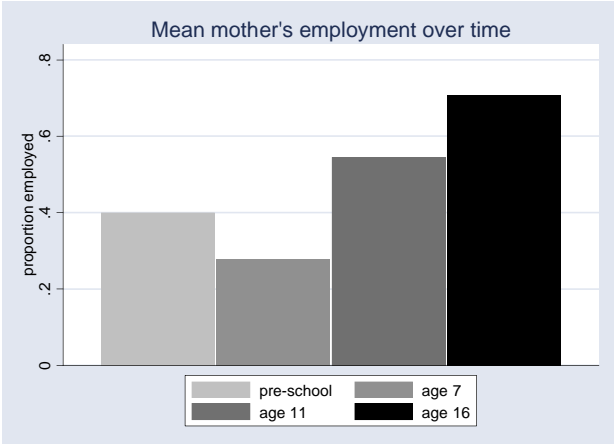
Figure 1: Mother’s employment

Table 6 shows the transition matrix of maternal employment. To look at the state dependence of each employment category over time, work status is split up into part-time and full-time wherever possible. The table shows that mothers often change employment status. For example, of all those who were employed full-time at age 7, 36.8% are not employed at age 11, 29.8% are employed part-time and 33.3% still have full-time jobs. With increasing child’s age, the likelihood of a mother being employed increases, especially for part-time work. In particular, mothers tend to start working at age 16 of the child, which was also seen in Figure 1. The data does not distinguish between part-time and full-time employment at this age.