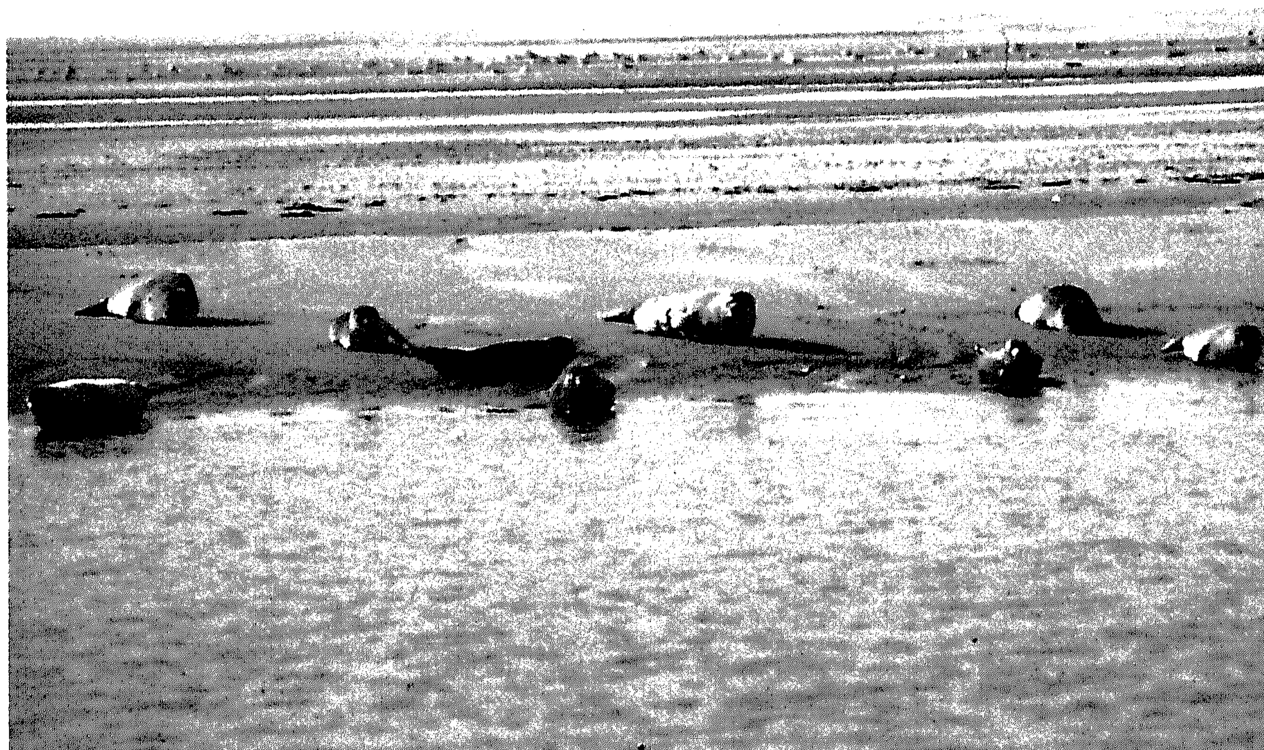
Figure 1. Mathematical models developed at CWI help to understand how farm or colony size affects the severity of an outbreak of a virus disease among pigs or seals.

veloping an algorithm to compute it in a special setting (motivated by the spread of Aujeszky's Disease Virus (ADV) among pigs on farms where the pigs are regularly shifted from one barn to another). A simple question ('When one farm is twice as large as another, what difference does it make for disease transmission?') initiated a new research direction, with field observations, lab experiments and theoretical modelling reinforcing each other.