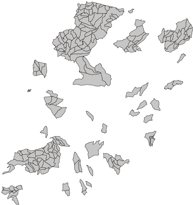
Figure 3. Reserve system selected for section 342I of the Columbia Plateau, using simulated annealing, with Boundary Length Modifier set to 1. All other details as in legend for Figure 2.

The simulated annealing method can be extended beyond the examples here, to incorporate more elaborate spatial requirements for species. For example, if several sites could be affected by the same catastrophe (e.g., a fire or hurricane), we might want to minimize the chances that all reserves for a given species are simultaneously impacted. This can be done by introducing a requirement that species occur in two or three sites, each separated by some minimum distance, while still attempting to minimize total area and boundary length.