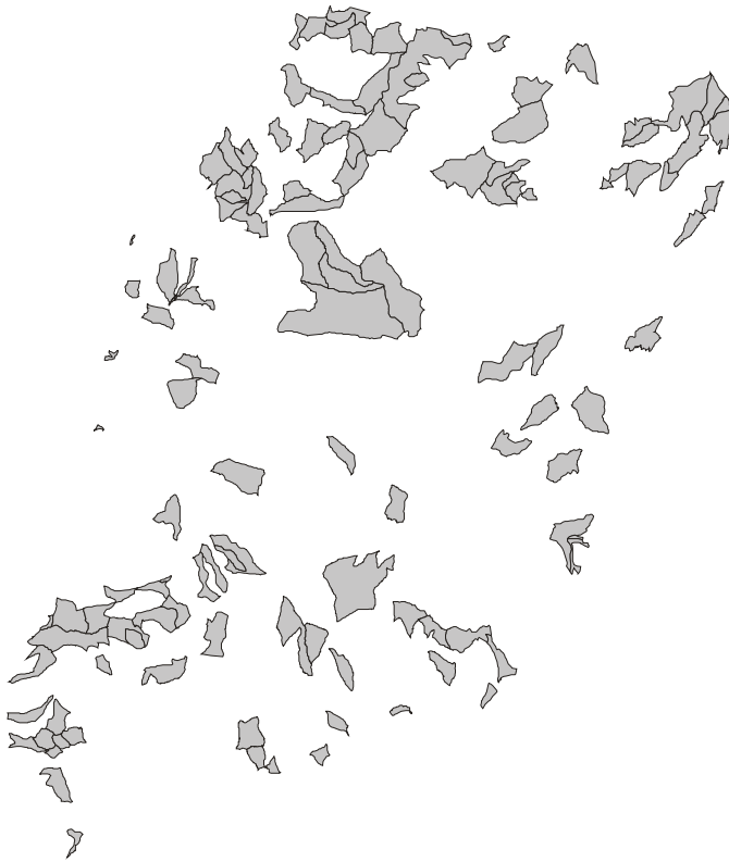
Figure 2. Reserve system selected for section 342I of the Columbia Plateau ecoregion, using simulated annealing, with Boundary Length Modifier set to 0. There are 821 sites (i.e., potential reserves), and the conservation goal is to conserve at least one occurrence of each of 113 species, rare plant communities, and common coarse-scale vegetation types. For species and rare plant communities, occurrences are measured by presence-absence data; for coarse-scale vegetation, occurrences are measured as area in hectares. Data sources are listed in Table 1.