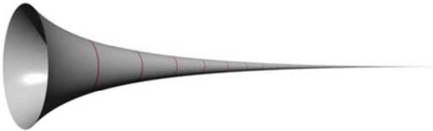
Figure 2. Torricelli's trumpet (Image from http://en.wikipedia.org/wiki/File:GabrielHorn.png ).

However, the horn evidently exists in the abstract, mathematical realm where the infinitely large and infinitely small readily co-exist. Without finite molecules to worry about, we can see that the horn's internal volume is also infinitely long as it extends into the endless and infinitely narrow tube. Obviously, a volume with an infinite dimension is definitely not finite. This presents no difficulty because \pi is not a finite integer. It is a transcendental number and has an infinite decimal expansion with cardinality \aleph_0 . Using Cantor's results, we can see that there is a one-to-one correspondence between the points in the horn's volume and the points on its surface. In fact, we already mentioned earlier how the numbers of points on any surface and in any volume are infinite, with the same cardinality \mathfrak{c} .