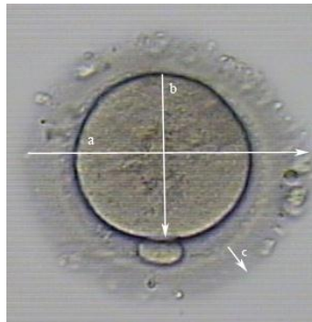
Figure 2. Dimentions that were measured during mormorphometry evaluation of oocytes after IVM.