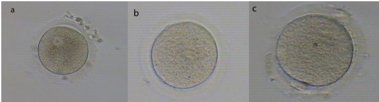
Figure 1. Morphological markers characterizing the meiotic status of human oocytes.