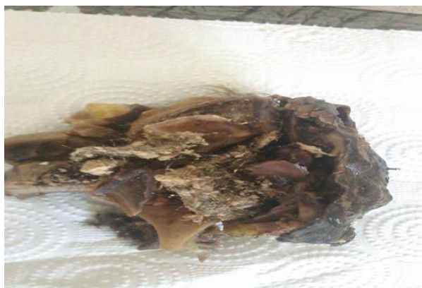
Figure 1. Gross appearance of mature cystic teratoma of adrenal gland

The patient underwent complete surgical resection of the right adrenal mass, a part of the right kidney, liver cyst, and retroperitoneal lymph nodes. All of the specimens were sent for pathologic examination. Grossly, the right adrenal mass weighted 400 g and measured 8.0 cm × 8.0 cm × 6.0 cm. The mass composed of a large cyst with sebaceous material and hair network. Some part of cyst wall had cartilaginous consistency (Figure 1).