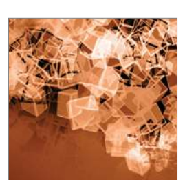
Discrete Dynamics in Nature and Society