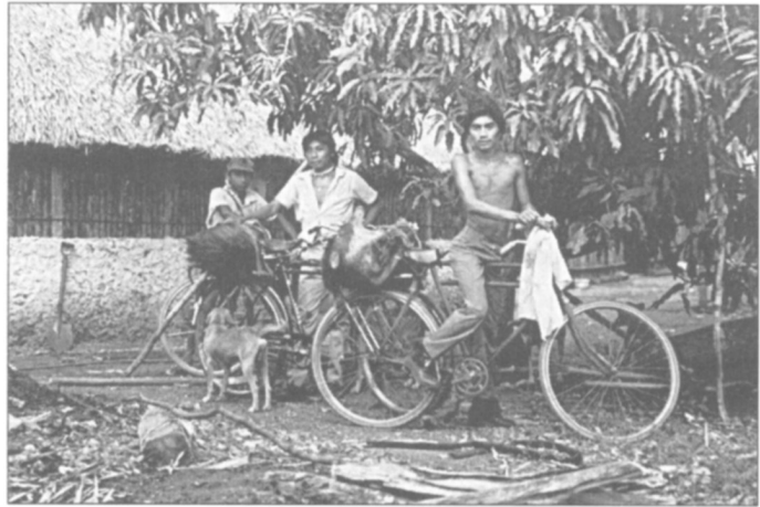
Maya hunter/gardener returning home on a bicycle after killing three white-lipped peccaries.

attract wildlife (Nations and Nigh, 1980; Greenberg, 1992). Gardeners at X-Hazil Sur still practise traditional shifting cultivation. During 1989–90, about 80–85 per cent of the adult men planted gardens. While most hunters planted gardens, few gardeners regularly hunted wild animals.