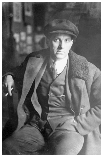
Vladimir Mayakovsky.

At some stage, the generations of Russians who had dreamed of a revolution (usually intellectuals raised within a bourgeois culture) found that a worrying question was buried deep in Leninist theory: what would become of them after the advent of Communism? What would proletarian culture be like in a collectivist society? If a vanguard was necessary to foment the revolution in proletarian and peasant Russia because the masses were ignorant of what they had to do, what would become of that vanguard once its 'pedagogical' and political task had been accomplished and a new culture had become hegemonic? Although the peace after class struggle would involve everyone, including revolution-