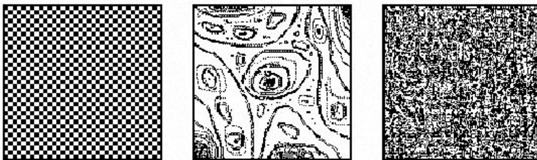
Figure 1. Variety increases from left to right, yet the human perceives the middle one the most complex (Grassberger 1991)

In addition to generalizing from the literature that complexity is the combination of three basic factors, we also identified two principles that contribute to the great diversity of complexity measures. One principle is observer dependency. As Edmonds (1999) described, "complexity only makes sense when considered relative to a given observer." One example would be the experiment performed by Grassberger (1991), where subjects were asked to assess the complexity of a set of images. Figure 1 shows three images that Grassberger used in experiments. The variety of the images, measured as the disorder of image pixels, increased from left to right, yet subjects perceived the middle one as the most complex. One explanation for this result is that the human visual system processes features such as orientation and spatial frequency rather than individual pixels per se. This experiment indicates that the impact of the variety factor on complexity depends on how observers process information.