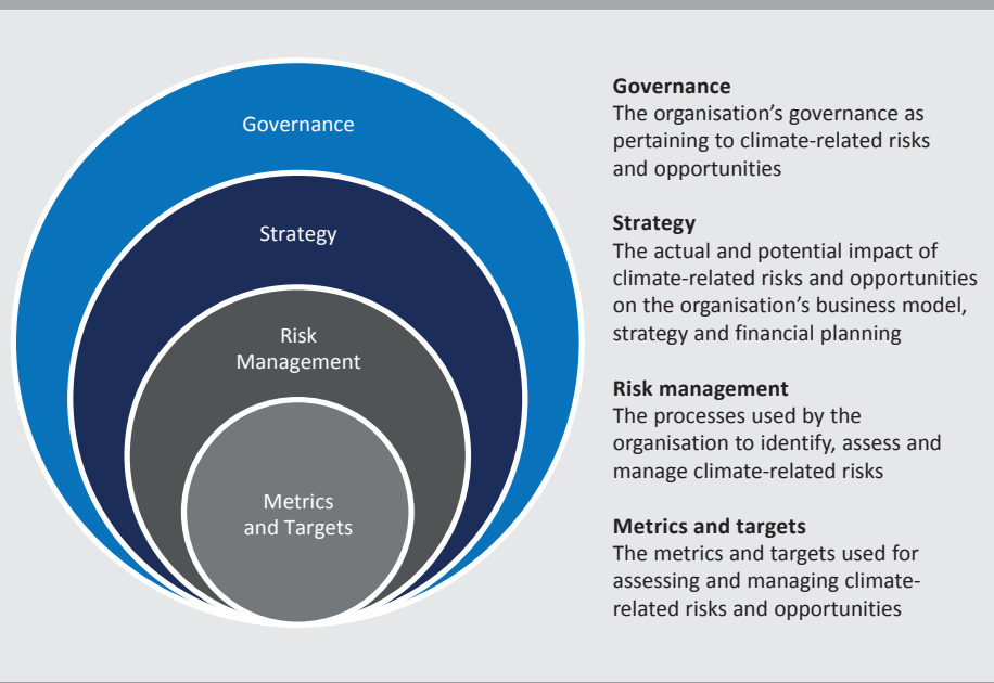
Figure 2 Four main areas of climate-related financial disclosure

The publication of reports analysing climate risk exposures has not yet become widespread among central banks. 27 The Bank of England publishes its analysis on climate change in a separate report, while the Dutch central bank incorporates its results into its annual report, providing little detail. One should also mention the French central bank's Responsible Investment Report ( BdF 2021 ), which examines sustainability issues on a broad horizon, covering other risks besides climate change. The methodology of the central banks publishing a separate TCFD report, i.e. the Bank of England and the Banque de France is presented below, along with the methodological background of the Magyar Nemzeti Bank's upcoming TCFD report 28 pertaining to the climate risk exposure analysis of financial assets.