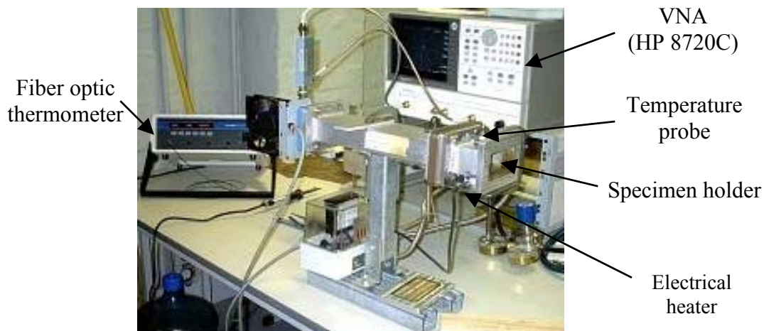
Figure 1: Experimental set-up

To measure the dielectric permittivity of wood at microwave frequency of 2.45 GHz and under high temperatures and pressures, the short-circuit line measurement technique was selected due to its well suitability for high temperature measurements. The experimental set-up (Figure 1) consists of a VNA (HP 8720C) system connected to a standard waveguide which for high pressure and temperature convenience was extended with a special designed high-pressure cavity. Used as the sample holder, the cavity was manufactured from stainless steel waveguide with build-in pressure applicator and Pyrex pressure window (transparent to microwave and resistant to 150°C and 5 atm.). The cavity is ended with an attachable fixed short-circuit. The sample temperature is progressively increased by means of an electrical heater placed underneath the sample holder. An immersion probe inserted within the sample detects and reads the temperature. As the measurement aim is to simultaneously perform internal wood temperature and pressure of about 150°C and 5 atm. respectively, air pressure is applied inside the cavity and it is controlled by the pressure gauge.