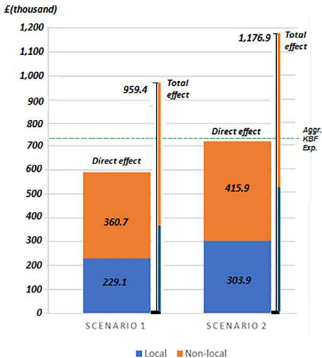
FIGURE 2 Comparison of KBF direct and total effects by scenario [Colour figure can be viewed at wileyonlinelibrary.com ]

the positive role of these businesses in view of creating jobs across the wider supply chain network, facilitating the retention of local resources within their spatial proximity.