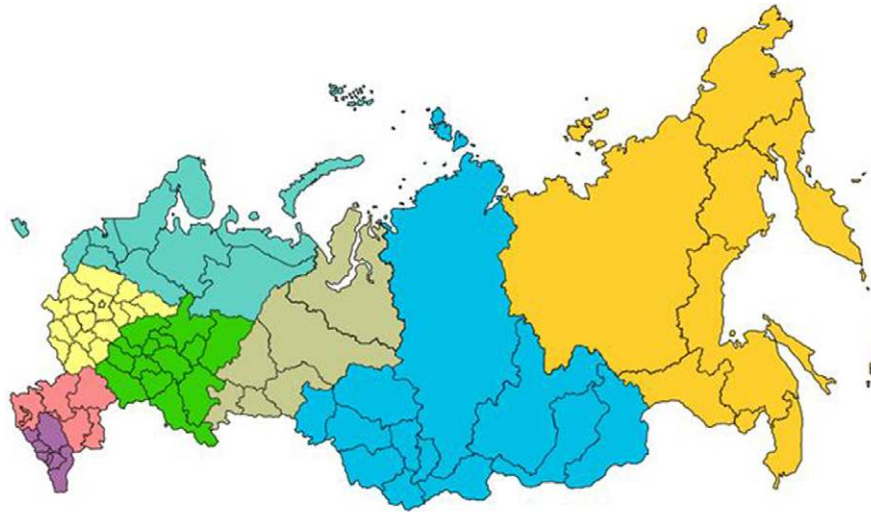
FIG. 1. Administrative map of the Russian Federation: eight Federal Districts and 83 Federal Subjects. [Color figure can be viewed in the online issue, which is available at wileyonlinelibrary.com .]