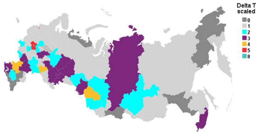
FIG. 3. Synergies in the knowledge-based economy of Russia at the level of 83 Federal Subjects (2011; N = 594,987 ; mbits of information). [Color figure can be viewed in the online issue, which is available at wileyonlinelibrary.com .]