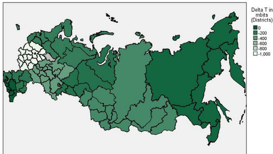
FIG. 2. Synergies in the knowledge-based economy of Russia (in mbits) at the level of the eight Federal Districts (2011; N = 593,987 ). [Color figure can be viewed in the online issue, which is available at wileyonlinelibrary.com .]

Sources. Eurostat (2014; cf. Laafia, 2002).