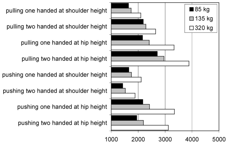
Figure 1. Quantification of all possible combinations of pushing and pulling, one and two handed, cart weight, and handle height in terms of predicted maximum compressive force at the low back. Results are estimated using GEE analyses.

For the remaining maximum values, all factors except handle height significantly affected the maximum resultant exerted force (table 2). Differences between pushing and pulling were found to be dependent on handle height, and the other way around. Except for the use of one or two hands, all factors significantly affected the maximum net moment at the low back. However, the interaction between pushing or pulling and the number of hands used appeared to be significant. One handed pulling was predicted to result in a significantly lower maximum low back moment (36 Nm) when compared to the other combinations of pushing, pulling, and number of hands used. Quantitatively, pushing or pulling and cart weight had a considerable effect on the maximum net moment at the low back. For displacing 320 kg, the maximum net moment would increase with 70 Nm. Except for the difference between pushing or pulling, which was dependent on handle height, all factors significantly influenced the maximum shear forces at the low back. Furthermore, all factors significantly affected the maximum value of the net moment at the shoulder.