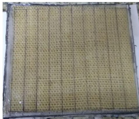
Fig.1: Sisal fiber composite

After molding, the composites remained at rest in the air for 24 h, when they were demoulded and later cut to make the specimens. Fig. 1 shows the composite ready to be cut.