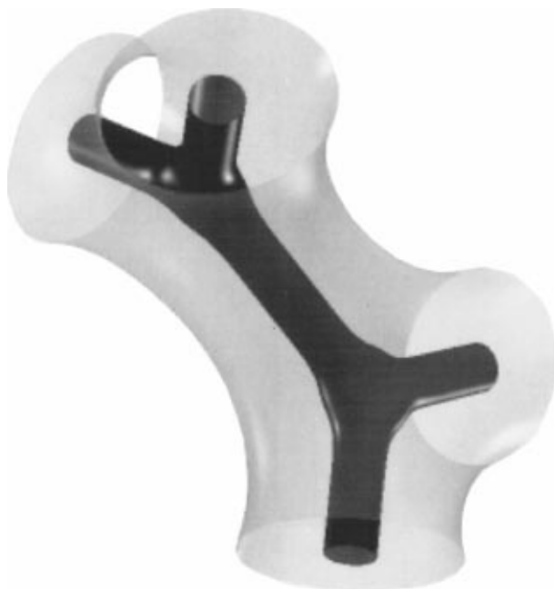
Figure 3 Schematics of skeletal graph (dark) and the intermaterial dividing surface of DG having overall 34% volume fraction PS. Shown here are two nodes connected by a strut, whose shape is constricted in the middle. Nanonecks may initiate in the thin centers of each PS strut.

yield simultaneously, whereas a distributed yield is indicative that there are highly variable stress concentrations in the sample, for example, due to different orientations and/or grain structures.