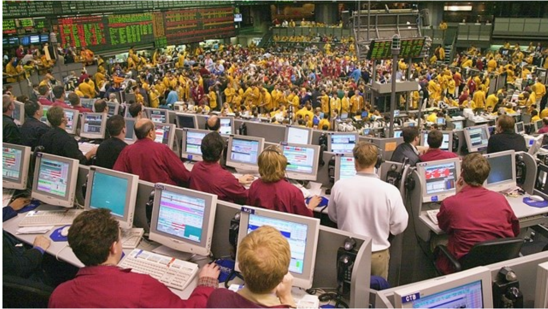
FIG 4 Globex terminals overlooking the Merc's S&P 500 trading pit, c. 2000. Reprinted with permission from CME Group Inc., 2013.