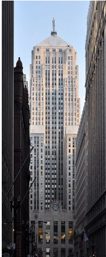
FIG. 6 The Chicago Board of Trade building, designed by Holabird & Root. 2011 photograph by Joe Ravi. Creative Commons license CC-BY-SA 3.0.