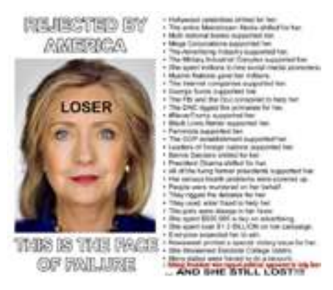
Figure 1: Anti-Hillary Meme posted on Daily Stormer, 3/6/17

macro in Figure 1). The milder images are intended to work as "gateway drugs" to the more extreme elements of alt-right ideology.