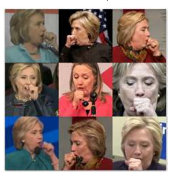
Figure 4: Hillary's Health Photo Collage

Before long, more mainstream conservative news outlets, such as the Drudge Report , began to question the state of her health, discussing Clinton's former blood clot, as well as instances in the past when she had fallen.<sup>246</sup> Sean Hannity devoted multiple nights of coverage to these issues on his Fox News show, in which he brought on various medical experts to speculate on the state of her health.<sup>247</sup> Most of these sources did not fully endorse the conspiracy theories, but they profited off them all