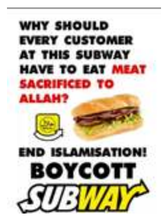
Figure 2: Anti-Islamic Meme posted on Daily Stormer, 3/6/17

appended Jewish names with such parentheses; users often manually add echo parentheses to posts in far-right online spaces. The goal is to demonstrate the extent to which Jewish people are present in elite circles and upper echelons of media by drawing attention to how frequently they are mentioned in the press.