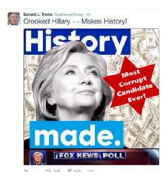
Figure 3: Hillary Clinton Meme Tweeted by Donald Trump

On July 2, 2016, Donald Trump tweeted an image of Hillary Clinton next to a Star of David graphic labeling her the "Most Corrupt Candidate Ever!" (Figure 3).<sup>235</sup> The image's background consisted of piles of U.S. currency. The combination of the Star of David, the money, and the suggestion of corruption evoked stereotypical ideas about Jewish people and referenced conspiracy theories about Jewish control of monetary systems.<sup>236</sup> National media outlets immediately noticed the image's anti-Semitic references and published critical responses or stories highlighting the social media backlash.<sup>237</sup>