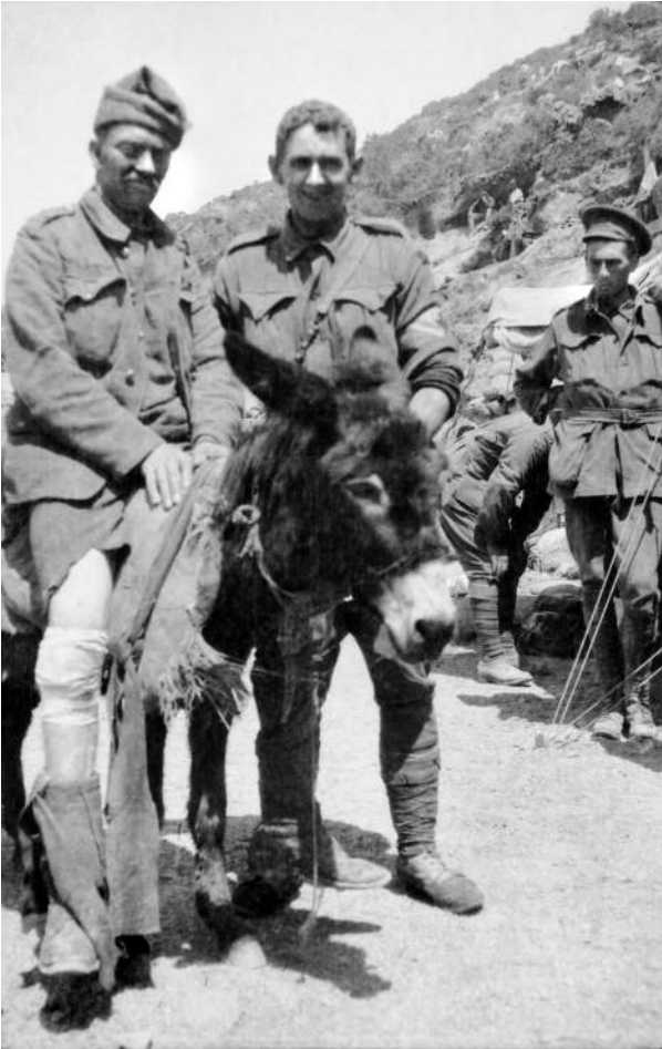
Private John "Simpson" Kirkpatrick and his donkey "Murphy" evacuating casualty with leg wounds, Gallipoli