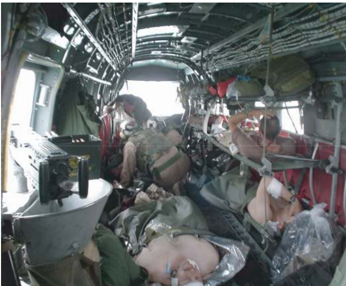
Casualties being evacuated by CH-46, IRAQI FREEDOM

Failure to identify the most needy casualties for evacuation imposes enormous burdens upon transportation assets and afloat facilities. Military planners unfamiliar with the realities of combat wound management often consider medical evacuation but an exercise in logistics, in which numbers of anticipated casualties, quantifiable capacities of transport facilities, availability times of transport shuttles, and numbers of available beds are the primary considerations. That view ignores the realities of wound care and implies an acceptance of an overall increase in deaths, or at least disability, and a decrease in the return of men to duty (see photo).