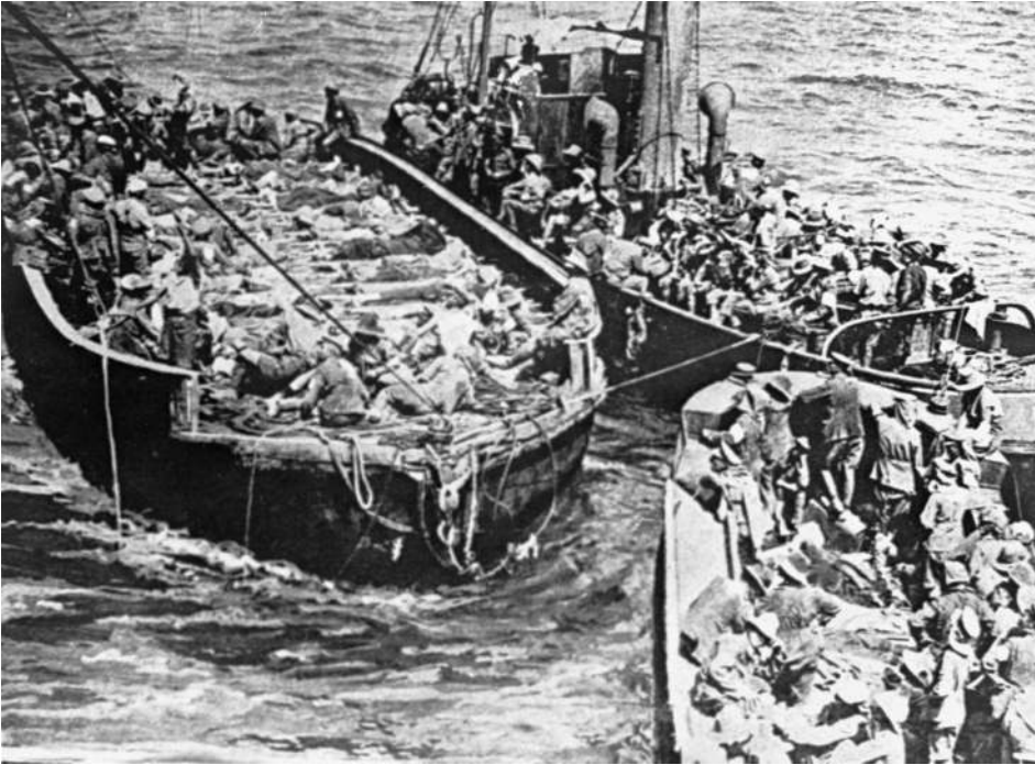
Seaward evacuation of wounded by barge from Anzac Cove, Gallipoli Australia War Memorial, C02679

medical assets (a “reduced medical footprint”) accompanying expeditionary forces inserted from sea bases allow critical, life-threatening wounds to be attended to adequately? If all that is available ashore is a meager casualty-sorting capability, and no efficient medical regulating network is established, will the results be any different from those experienced at Gallipoli?