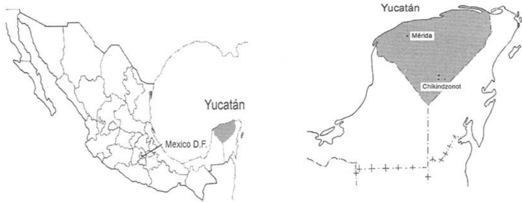
Fig. 1. Region of fieldwork.

national Mexican culture. The so-called “caste war” of the last century which involved the Maya, is just one example of the resulting conflicts (Orosa D. 1991).