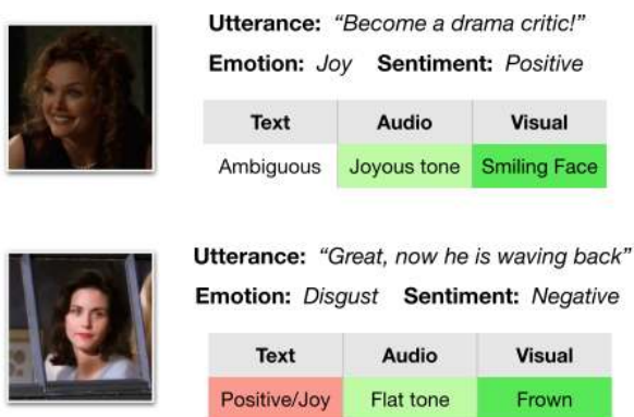
Figure 2: Importance of multimodal cues. Green shows primary modalities responsible for sentiment and emotion.

ity is particularly important. For the utterances with language that is difficult to understand, we often resort to other modalities, such as prosodic and visual cues, to identify their emotions. Figure 2 presents examples from the dataset where the presence of multimodal signals in addition to the text itself is necessary in order to make correct predictions of their emotions and sentiments.