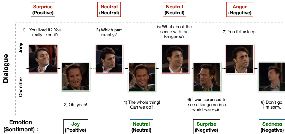
Figure 1: Emotion shift of speakers in a dialogue in comparison with their previous emotions.