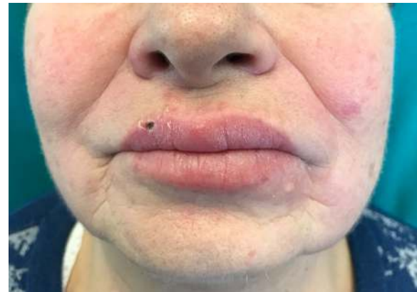
Fig. 1 Clinical aspects. Lip swelling and healing blister upon presentation

A 71-year old, female patient with a previous history of non-Hodgkin lymphoma and transient ischemic attack came to the emergency room of our University Hospital for sudden onset of right hemifacial paraesthesia, edema of the lower lip (Fig. 1) and accentuation of an already present tinnitus. The current presentation had been preceded by a few blisters similar to those usually observed in herpes labialis, and no aphthous ulcer was detected on mouth inspection. Background therapy included aspirin and betahistine, with no personal and family history of adverse drug reactions, atopy, contact dermatitis, urticaria, angioedema, cranial nerve palsy, granulomatous or inflammatory diseases. After symptomatic treatment by intravenous steroids and antihistamines, the patient was discharged with prescription of a short-course therapy with oral prednisone and cetirizine [6]. This resulted in partial remission of symptoms, but 1 week later the patient was readmitted to ER for symptom recurrence and worsening of lip edema without detectable oral cavity and tongue alterations. Due to the apparent involvement of the 5th cranial nerve, a varicella-zoster virus (VZV) infection was hypothesized and therapy with valaciclovir initiated. On occasion, a blood sample was drawn showing