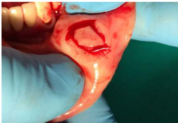
Fig. 2 Lower lip biopsy

with the leukotriene receptor antagonist montelukast [7] failed to solve the edema. Finally, clinical picture, blood analyses, and lack of response to any of the previous therapies suggested the possibility of Melkersson–Rosenthal syndrome [4]. Thus, the patient was referred to the Dental Clinic, where a mucosal biopsy of the affected lower lip was performed (Fig. 2). Histopathological