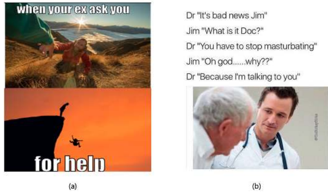
Figure 1: Dominant text patterns in (a) Facebook dataset (b) Pinterest dataset.

predicted text from a sample of 30 annotated images from both datasets.