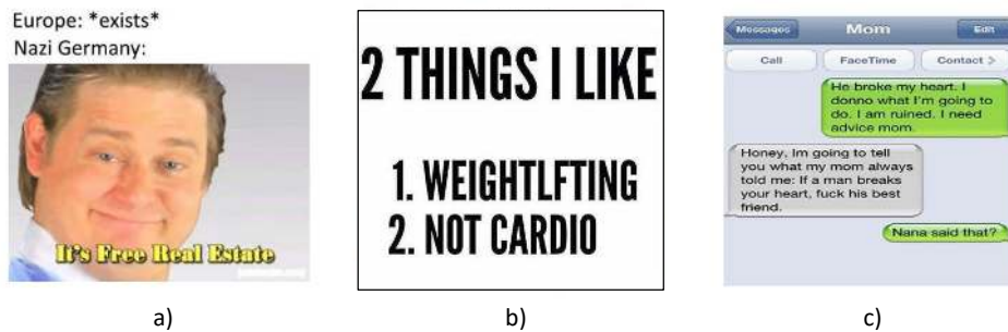
Figure 2: Different types of memes: (a) Traditional meme (b) Text (c) Screenshot.

To prepare the data needed for training the ternary (i.e., traditional memes, memes purely consisting of text, and screenshots) classifier, we annotate the Pin dataset with manual annotations to create a balanced set of 400 images. We split the set randomly, so that 70% is used as the training data and the rest 30% as the validation data. Figure 2 shows the main types of memes encountered. The FB dataset only has traditional meme types.