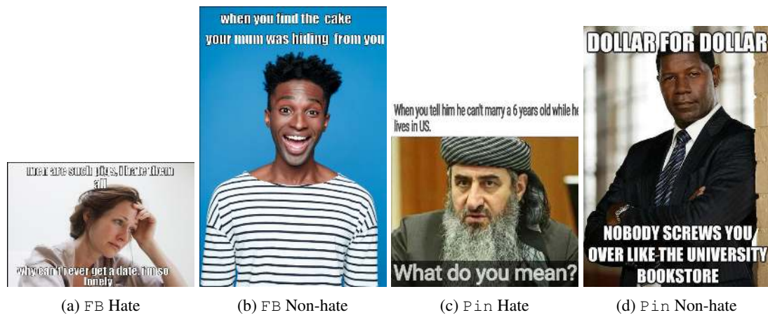
Figure 4: Samples of faces in FB Hate, FB Non-hate, Pin Hate, and Pin Non-hate datasets, and their demographic characteristic predicted by the DEX model: