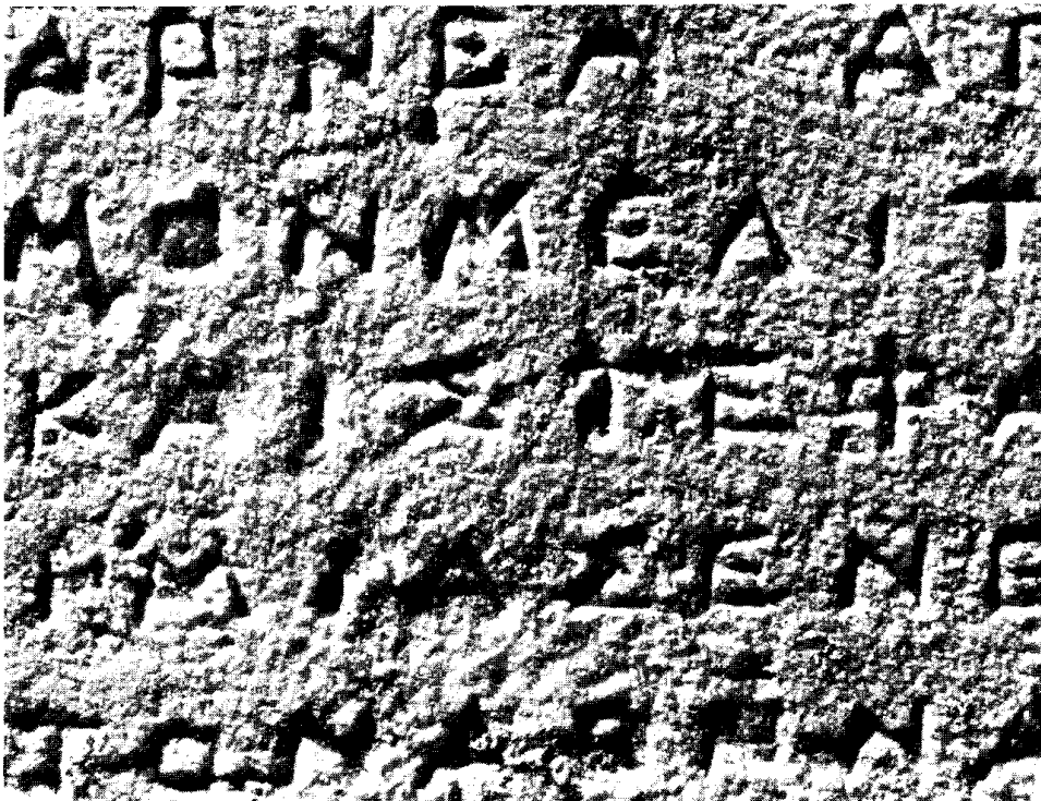
Figure 2. EXCERPT OF AGORA I 3238 (LINES 6-10)