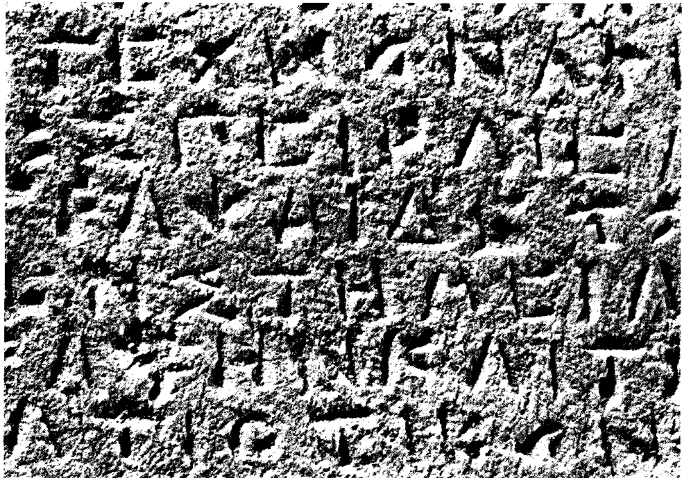
Figure 4. EXCERPT OF AGORA I 247 (LINES 59-64)