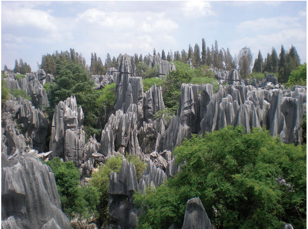
Stone Forest, Shilin, Yunnan, China

Copyright © 2014 Massachusetts Medical Society.