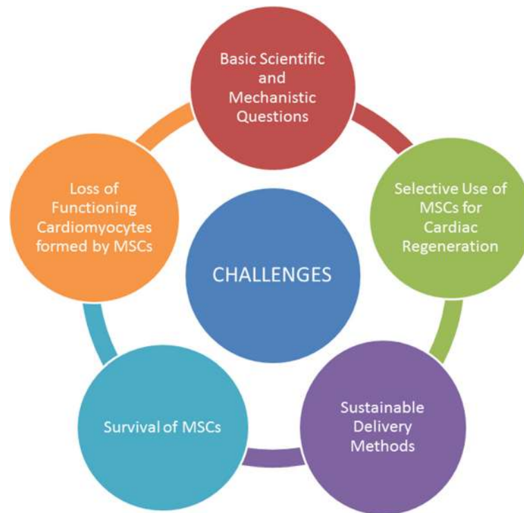
Fig. 2 Challenges in use of MSCs for cardiac regeneration. Tumour formation in MSCs has been considered inconceivable, but there have been instances of osteosarcoma in patients infused with BM-MSCs for some other disease. Hence, in the context of MSCs in cardiac regeneration, some pathways and processes might exist that still remain unexplored. Additionally, these pathways comprise MSCs obtained from different sources, out of which only a few such as BM-MSCs have been used extensively for clinical applications, in spite of evidences of more proliferative capacity in MSCs obtained from umbilical cord, peripheral blood, etc. This limitation arises due to the lack of an efficient delivery method of MSCs to the target site. Another challenge that has seemed to come in the way of researchers is the prolonged survival of MSCs post engraftment into the host myocardium. This challenge has been overcome to a large extent by using miRNAs and CCs, but more sustainable methods need to be studied further. Studies have gained several advancements in the field of safety and efficacy of the MSC therapy, but success rates in terms of the functional regeneration of cardiac tissue for the loss of functioning cardiomyocytes after any damage remain mediocre. MSC mesenchymal stem cell

methods to the intended site of regeneration and reduced survival of transplanted MSCs. The delivery methods for specific MSCs to the specific site of injury have yet not been established, although several delivery systems such as engineered tissue constructs and biomaterials have been explored for the same in order to gain maximum efficiency. For improving the survival of MSCs, researchers have