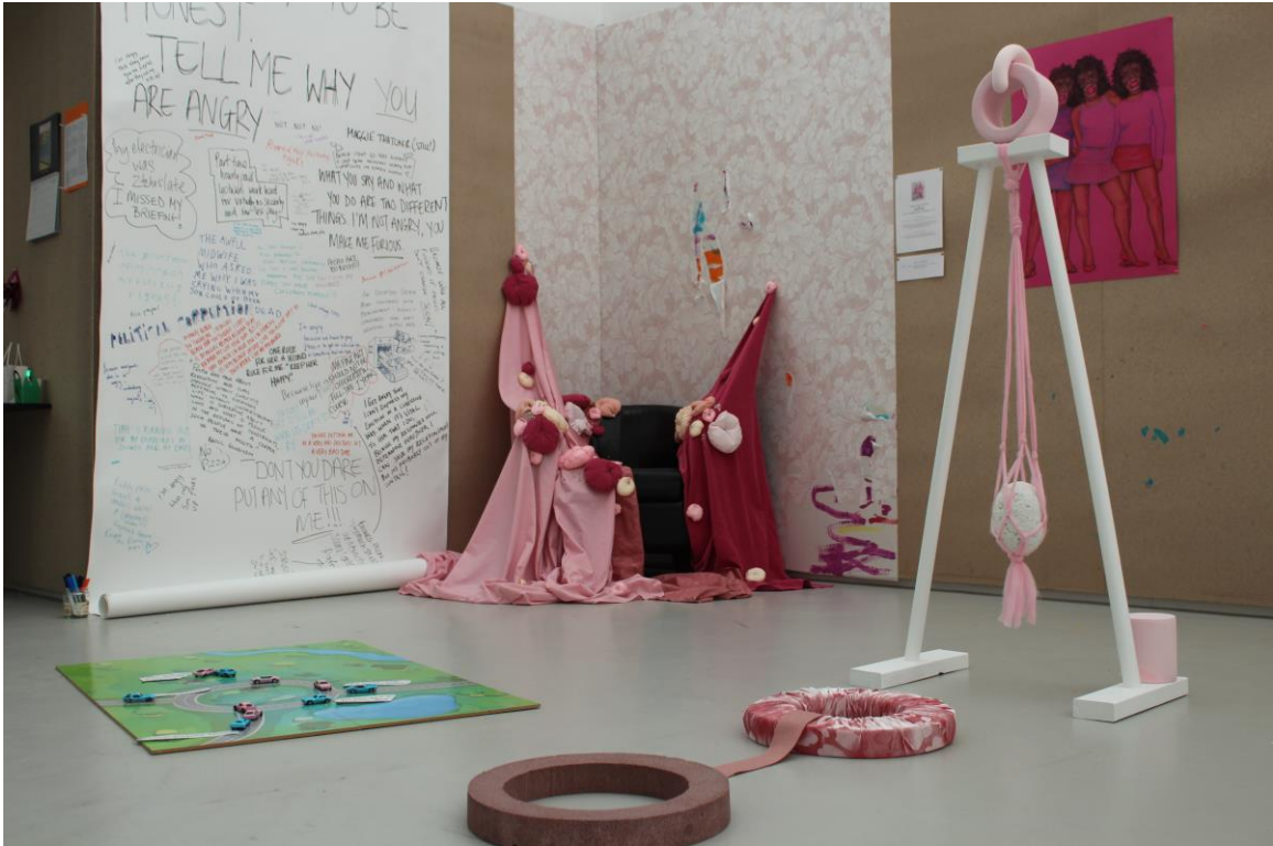
Fig. 1. ‘CUNTHOUSE’. ‘Messy Democracy’, installation view.

‘One can teach what one doesn’t know if the student is emancipated [...] To emancipate an ignorant person, one must be, and one need only be, emancipated oneself’ (Rancière 1991: 15).