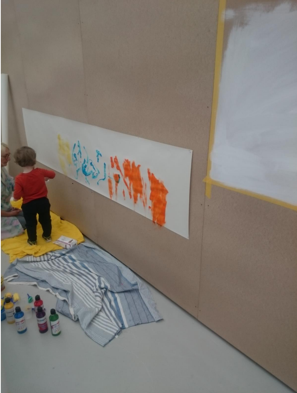
Fig. 4. 'Messy Democracy', installation view.