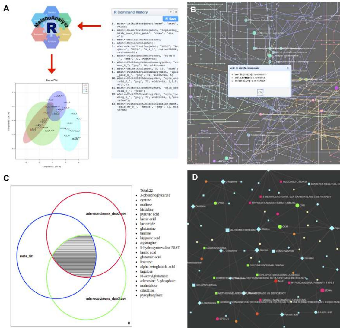
Figure 2. Summary of new features introduced in MetaboAnalyst 4.0. (A) An illustration showing the R command history panel and the companion MetaboAnalystR package will allow users to easily reproduce their analyses. In this case, the R command history captures all R commands leading to the generation the PLS-DA 2D score plot, which can then be reproduced in MetaboAnalystR using identical R commands (except the file path parameter for user input). (B) A zoomed-in view of the KEGG metabolic network showing the potential metabolite hits predicted from the mummichog algorithm. Clicking on a highlighted node will display all possible matched adduct forms of the corresponding compound. (C) An interactive Venn diagram showing the results from a biomarker meta-analysis. Clicking on an area will show the corresponding hits. (D) An example of the metabolite-gene-disease interaction network created based on user input.

Compound database. MetaboAnalyst performs in-house mapping of common compound names to a wide variety of database identifiers including KEGG (20), HMDB (21), ChEBI (22), METLIN (23) and PubChem (24) prior to performing any functional analysis. This knowledgebase has been updated with HMDB Version 4.0, including updates of HMDB identifiers and links to other databases. As a result, MetaboAnalyst's compound database has been expanded to include ~19 000 compounds. They represent the core subset of HMDB compounds (~114 100) with more detailed annotations relevant for downstream functional analysis.