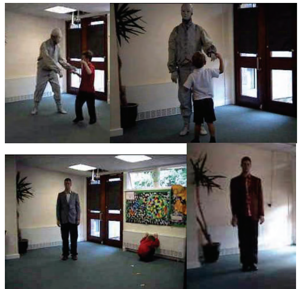
Figure 2: HRI Experimental Paradigms: The Theatrical Robot used to evaluate interactions of children with autism with a humanoid robot of either 'robotic' (reduced features) or 'human-like' (full human features) appearance, while behaving identically (Robins, B. et al. 2006).

Figure 1 shows a sketch of a typical development time line of HRI robots. In an initial phase of planning and specification, mock-up models might be used before hardware and software development commences (Bartneck, C. & Jun, H. 2002). Once a system's main components have been implemented, a WoZ study is applicable, and/or video based methods can be applied (Woods S., et al. 2006). As soon as working prototypes exist that also conform with safety requirements, interaction studies can be conducted. The Theatrical Robot paradigm allows one to conduct interaction studies even from the early phase of planning and specification onwards throughout the whole development of the robot. Once working prototypes exist mock-up models or the Theatrical Robot are likely to become less useful since interaction studies can be run with the 'real system' rather than its embodied simulation. However, the Theatrical Robot can also be used as a stand-alone-method, without necessarily being linked to a robot development project. For example, the Theatrical Robot paradigm has been used successfully in a study investigating how children with autism respond to a robot with different appearances (Robins, B. et al. 2006).