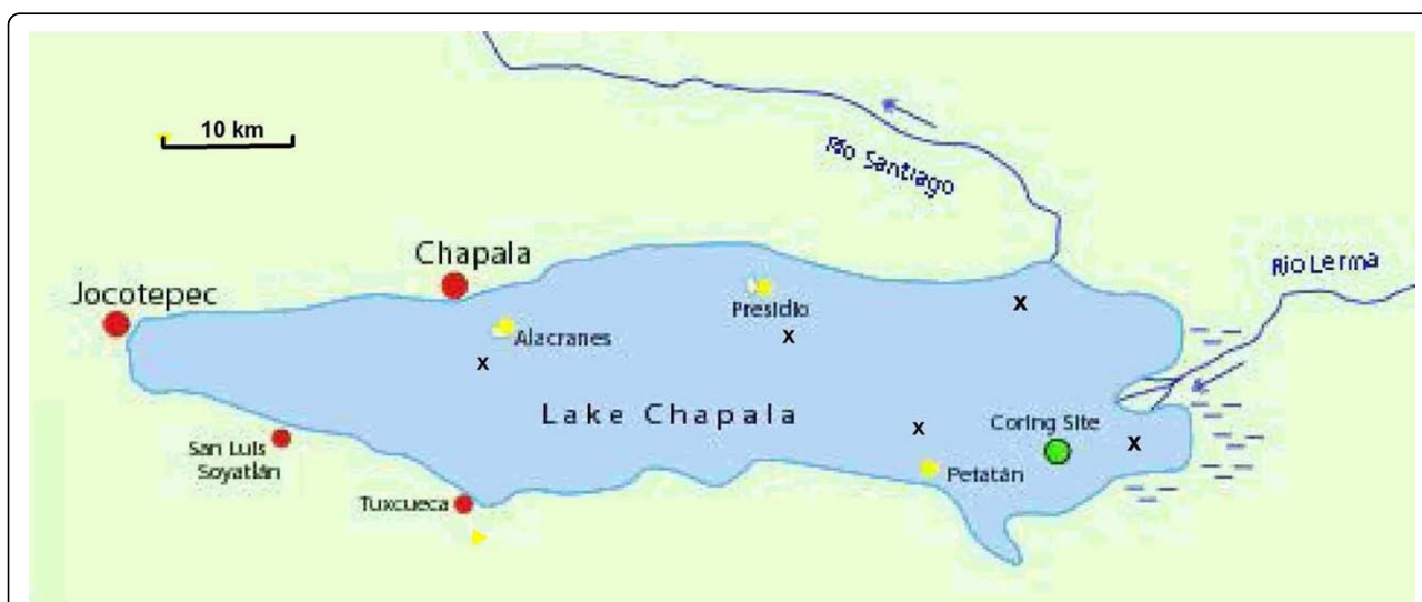
Figure 1 Map of Lake Chapala and Study Locations. Suspended particle sampling sites are shown as x's and named (Table 4) for nearby rivers (Lerma and Santiago) or islands.

Samples of fish from Lake Chapala, including commonly consumed carp, charales (whitefish), and tilapia were obtained by purchase from local fishermen who were observed catching the fish from the lake. The samples were originally stored at 0-4°C, but warmed to ambient temperature during the two-day transport to Rensselaer Polytechnic Institute (RPI). Subsequent testing (see Table S-2, Additional file 1) indicated that such handling does not significantly affect total mercury concentrations. Samples of skinless filet from tilapia and carp as well as headless, eviscerated charales, typical representations of "edible portions" of the respective species,