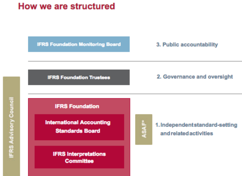
Figure 1: The IASB's structure

*Accounting Standards Advisory Forum (representatives of the international standard-setting community)