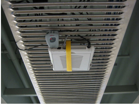
Figure 1. A SAP implementation using a AP-70 WiFi access point, with a Moteiv Tmote Invent attached via USB interface.

delegation on the fidelity of the sensed data is related to the sensitivity of the sensing instruments (e.g., motion detector range) on the sensor. Mobile sensing delegates may be forced, due to mobile sensor custodian mobility, to acquire data at a distance from the intended target beyond the optimal sensitivity threshold of the sensing instrument. In this case the quality of the sensed data often decreases monotonic with the sensor's distance from the target. Static networks are often deployed to provide complete sensing coverage over all regions of interest. However, this is not feasible at urban scale.