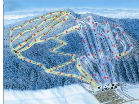
Figure 2. An instrumented SkiScape. Dots mark fixed trail sense points. Squares mark collection points at the mountain base.

As this surrogate WiFi network will be the same network used for day to day operations, the SAP network will be highly representative of a realistic MetroSense de-