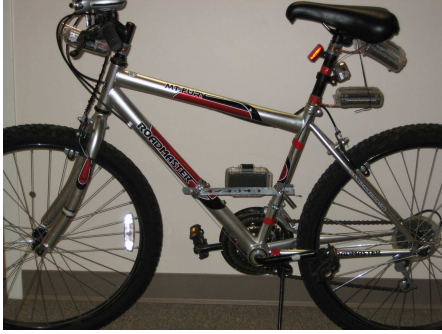
Figure 3. Bicycle in the BikeNet testbed outfitted with sensor to measure pedal speed, wheel speed, road/trail slope angle, and compass direction.

act preventative maintenance (e.g., close trail, make artificial snow). Safety/emergency personnel are interested in tracking skiers' location and speed in case of accidents (e.g., fall off trail, avalanche), and also to prevent accidents by speed policing. Skiers may be interested in tracking their own location or the location of their friends on the mountain, as well as avoiding lifts with long queues.