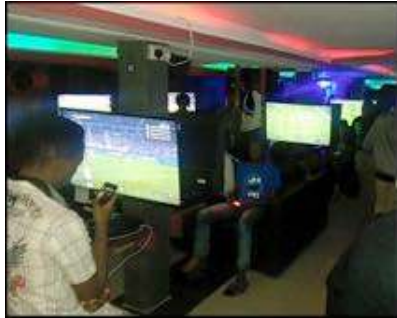
Figure 10: Gaming parlour, Nairobi CBD (2016), commissioned photography

spaces and mentoring. And there are others, too, with more springing up every year (Ross, 2013).