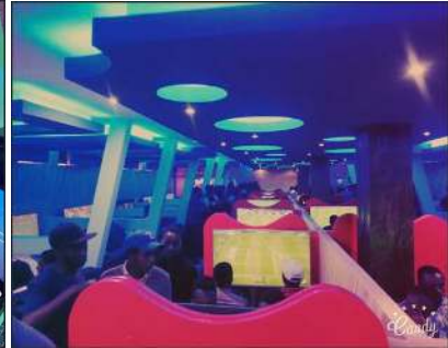
Figure 12: Gaming parlour, Nairobi CBD (2016), as seen at naibuzz.com