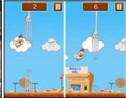
Figure 9: Kuku Sama (2015), by Black Division Games, screenshot of gameplay