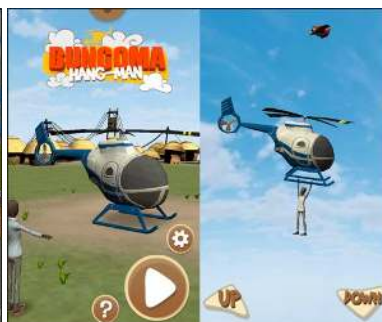
Figure 14: Bungoma Hangman (2016) by Frank Tamre, screenshot of gameplay