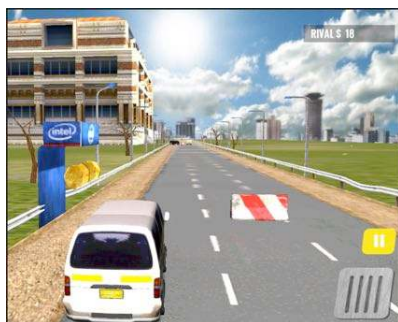
Figure 13: Ma3Racer (2012) by Joe Muriithi Njeru, screenshot of gameplay

[...] educate you on your rights and freedoms as a citizen. Many are times we are treated as the puppets and yet we are the puppeteers. We control them not the other way around! (Mekan, 2017 http://www.mekangames.com )