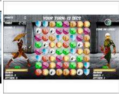
Figure 3: Africa's Legends (2014), by Leti Arts, screenshot of gameplay