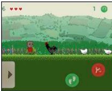
Figure 5: Kade (2015), by Urban Design Kings, screenshot of gameplay