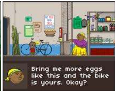
Figure 6: Kade (2015), by Urban Design Kings, screenshot of gameplay