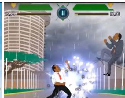
Figure 15: Knock-out 2017 (2017) by Mekan Games, screenshot of gameplay