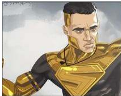
Figure 4: African Superman (2016), by Salim Busuru, as seen at salim_busuru.artstation.com

Urban Design Kings and other Kenyan developers are tapping into a fast-growing mobile market within Kenya where, according to the Communications Authority of Kenya, the number of mobile subscriptions in September 2015 was almost 38 million, up from almost 33 million in September 2014. However, according to Evans, while games that can be described as ‘local’ in terms of their characters and settings are aimed at a developing Kenyan market, that market is not yet adequately developed and most of the projects generated by Urban Design Kings do not offer enough income to allow the studio to operate at a profit. With the explicit aim of developing a local gaming community, growing the Kenyan games industry around narratives from within Kenyan culture, the trio have launched the online platform ChekiChezo ( http://www.chekichezo.com/ ) - a website for Kenyan developers to meet virtually, and upload and share their portfolios.