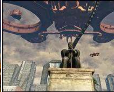
Figure 8: Nairobi X (2014), by Andrew Kaggia , screenshot of gameplay