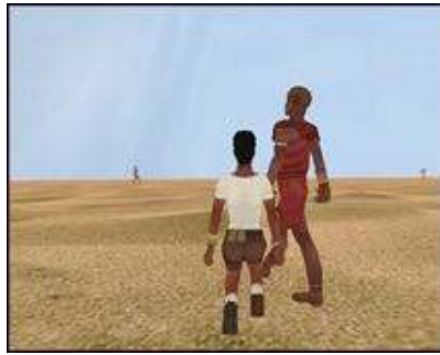
Figure 1: Adventures of Nyangi (2012), by Wesley Kirinya, screenshot of gameplay