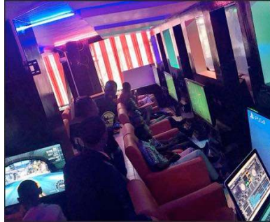
Figure 11: Gaming parlour, Nairobi CBD (2016), commissioned photography