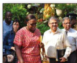
Country Director of World Bank visiting Thalavitiya Egoda Village Kuruwita