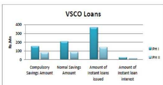
Figure 8: VSCO Loan Progress – Ph I & II