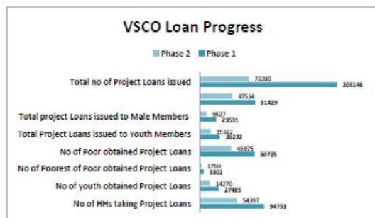
Figure 7: Progress of VSCO loan program with Phase wise (cumulative)