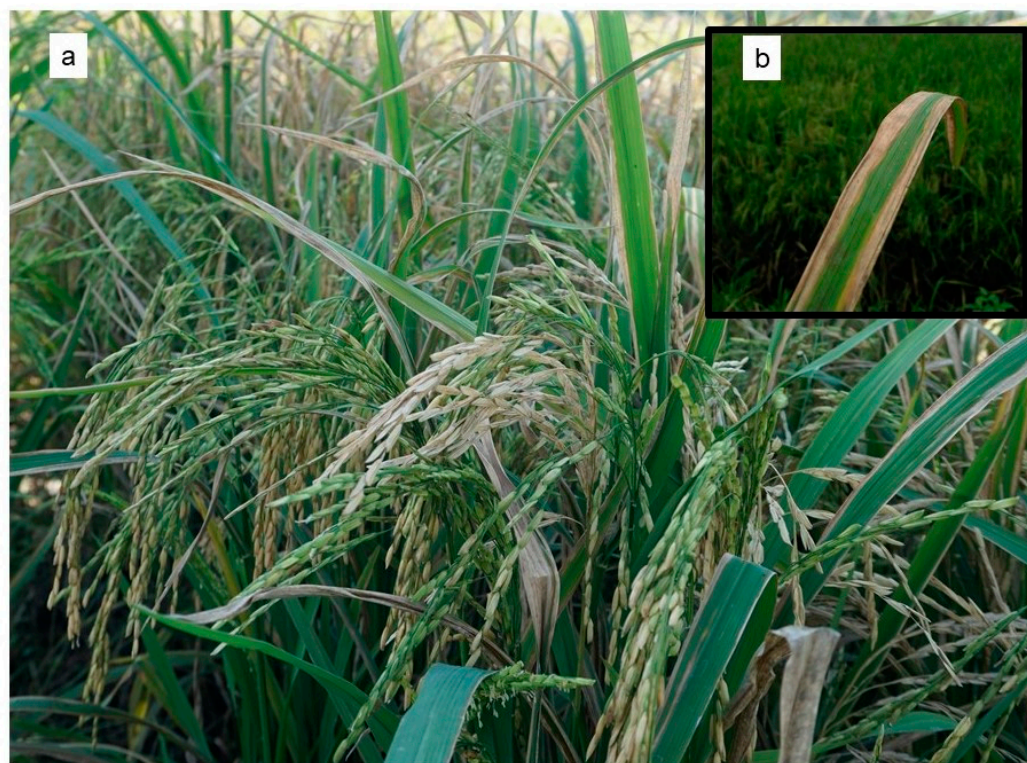
Figure 2. Cont.

At present, plant diseases are controlled mostly by using chemical biocides and in some cases by cultural practices. However, the widespread use of agrochemical products in agriculture has been a subject of public concern and scrutiny due to potential harmful effects on the environment, undesirable effects on non-target organisms, and the possible carcinogenicity of some chemical elements [7]. Plus, the intensive use of biocides has led to the development of resistance applications leading to outbreaks of rice diseases (Figure 2). An alternative method for controlling plant diseases is by strengthening plants' own immunity to diseases through plant–microbial interaction [104]. Several microorganisms belonging to different genera known to elicit induced systemic resistance (ISR) in plants are reported to be effective tools for the biological control of certain plant pathogens [105].