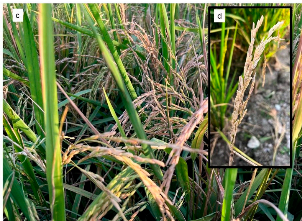
Figure 2. Excessive use of biocides and chemical fertilizers resulted in the severe outbreaks of various rice diseases in Selangor, Malaysia: (a) Rice plants infected by Pantoea spp. with a yellowish leaf blight disease lesion on the leaves that leads to unfilled, empty, and discolored grains, (b) Close-up view of the infected leaf with a lesion at the edge (adapted from Doni et al. [16], the journal does not require permission to use materials), (c) Typical field symptoms of bacterial panicle blight caused by Burkholderia glumae with discoloration and sterility of grain as well as rotting and panicle blanking, (d) A close look at the severely infected panicle. The panicle remains upright rather than bending down with the weight of the grain. Therefore, the use of beneficial microorganisms for the biological control of plant diseases needs to be encouraged and promoted as a powerful solution to replace toxic chemical biocides.