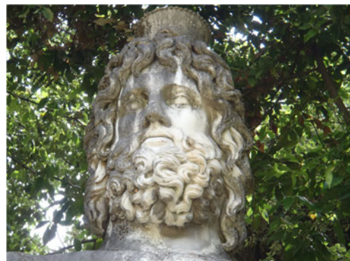
Fig. 1 Sculpture made of white Carrara marble with black discolorations caused by fungi and lichens; Boboli Park, Florence, Italy

The role of chemoheterotrophic bacteria in the weathering of rock probably depends largely on the environmental conditions: while bacteria might evolve in humid environments and form biofilms within the porous space of building stone, in arid and semi arid environments their occurrence might be limited. However, chemoheterotrophs are not only contributing to the weathering of rock. This group of microorganisms has been shown to have some impact on the consolidation of rock and plaster because they enhance calcium carbonate precipitation by passive and active processes. Strains of Bacillus cereus and Myxococcus xanthus have been used to