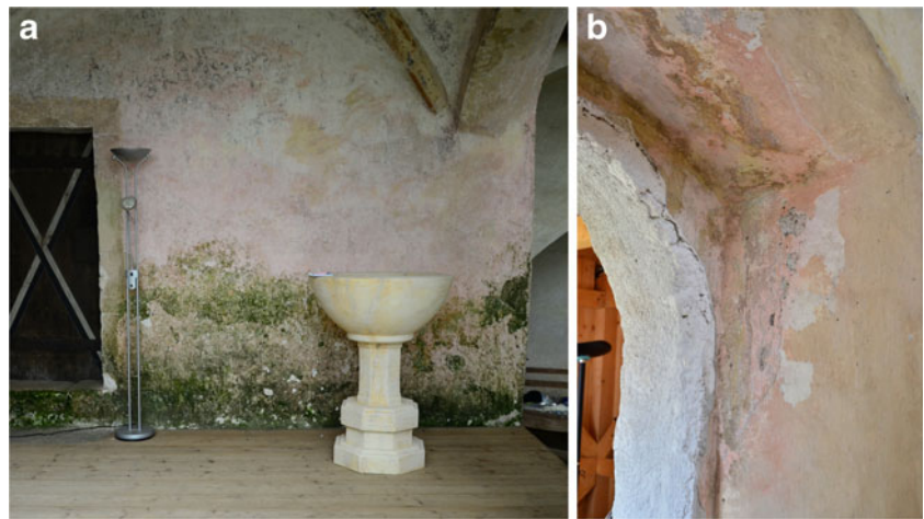
Fig. 2 a Green algal and cyanobacterial stains on mortar surfaces in the castle of Rappottenstein (Austria). b Rosy stains characteristic for halophilic and halotolerant archaea and bacteria.

actively bio-induce calcite precipitation to reinforce monumental stone (Castanier et al. 1999; Ettenauer et al. 2011; Fernandes 2006; Jimenez-Lopez et al. 2007; Piñar et al. 2010; Rodriguez-Navarro et al. 2003; Tiano et al. 1999).