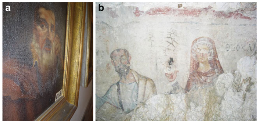
Fig. 4 a White fungus growing in the craquelées of an oil painting (Stift Lilienfeld, Austria); b growth of black fungi on the wall paintings of the Paulus grotto near Ephesus, Turkey.

The degradation of documents made of parchment — which is mainly composed of collagen — is a complex process, which involves the chemical oxidative deterioration of amino acid chains and hydrolytic cleavage of the peptide structure. Microorganisms can hydrolyze collagen fibres and other protein-based materials, but can also modify the inorganic components, or produce pigments and organic acids which discolour the parchment. Bacteria displaying proteolytic activities play a major role in the deterioration of ancient documents and books made of parchment. Species belonging to the genera Bacillus , Staphylococcus , Pseudomonas , Virgibacillus and Micromonospora have been isolated from deteriorated parchments (Kraková et al. 2012). In addition, some alkaliphilic bacteria (microbes that thrive in environments with a pH of 9 to 11) and several species of the Actinobacteria have been detected in connexion with a typical damage phenomenon, namely a parchment discoloration consisting of purple spots (Pinzari et al. 2012; Piñar et al. 2011; Strzelczyk and Karbowska-Berent 2000). Parchment