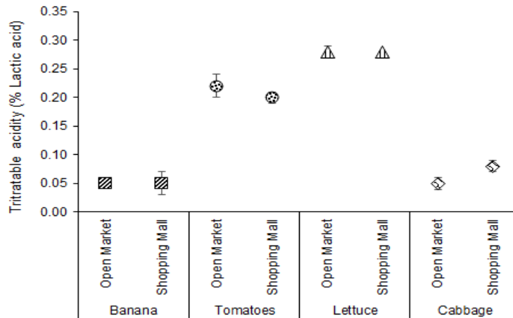
Fig. 2. Tritratable acidity (%Lactic acid) of the selected fruits and vegetables from the open market and the shopping mall in Port Harcourt metropolis

Bars and error bars are the mean and standard deviation of duplicate samples. The means for each sample from the two locations did not varied significantly ( P>0.05 )