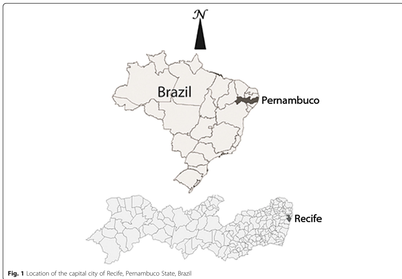
Fig. 1 Location of the capital city of Recife, Pernambuco State, Brazil

indicator used. It establishes intra-strata homogeneity and between-strata heterogeneity. Statistically, this aims to maximize the variance between the groups and minimize the variance within each group.