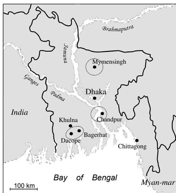
Figure 1 | Map of Bangladesh showing the major rivers and larger cities. The respective sampling areas are indicated with circles.

night) in the drying oven the filters were checked for dryness and dry filters were stored cool (when possible at 4 °C) in an airtight box with dry silica gel. From each water sample duplicate subsamples for toxin analysis were prepared and transported to Germany.