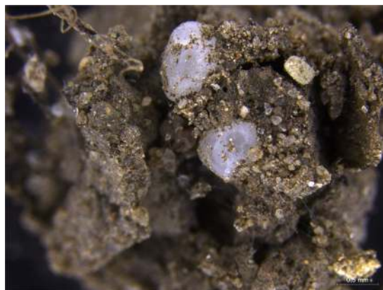
Figure 3. Polyethylene (PE-2; 1180–1400 μm) microplastic particles incorporated into surface middens. Picture taken during the harvest of the experiment.

following passage through the gut (the latter is supported by the pervasive presence in droppings). To further support the ingestion/egestion mechanism, Huerta Lwanga et al. 12 have also documented the presence of PE microplastic particles (<150 μm size was used in their study) in earthworm egestate. Our study was not specifically designed to distinguish the relative importance of these transport mechanisms. Now that transport by earthworms has been shown, future studies should aim at disentangling these different transport pathways, also as a function of soil properties (in particular texture and structure) and amount of plastic material. For example, Huerta Lwanga et al. 15 , having compared different concentrations of PE microplastic (rather than sizes, as we have done), find concentration-dependent incorporation of microplastic material into burrow walls (data normalized to worm biomass). Additionally, it will be important to next design studies under field conditions to capture transfer rates under more realistic conditions.