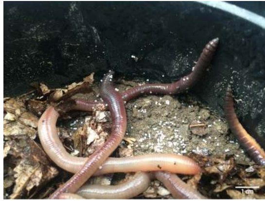
Figure 4. Polyethylene (PE-1; 710–850 \mu\text{m} ) microplastic particles adhering to the skin of two earthworms. Picture taken during the harvest of the experiment.

Earthworms are not the only soil biota producing biopores, for example also plant roots produce extensive biopores (e.g., ref. 16). This means that also other soil biota could be examined for the potential to enhance movement of microplastic down the soil profile. In addition to biopore-producing biota, other soil biota may also contribute to the vertical and horizontal movement. It is conceivable that termites, collembola, enchytraeids or nematodes move such particles in soil 13 , albeit likely at a smaller spatial scale than what we observed for earthworms in the short term. At a larger scale, animals such as gophers, moles, or voles may be important. In agroecosystems, where microplastic application is perhaps most likely, there additionally is the factor of ploughing, which would be expected to greatly contribute to incorporation of materials into the soil.